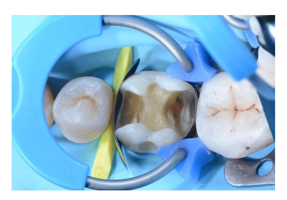
Occlusal view of the first molar equipped with LumiContrast sectional matrices and wedges.