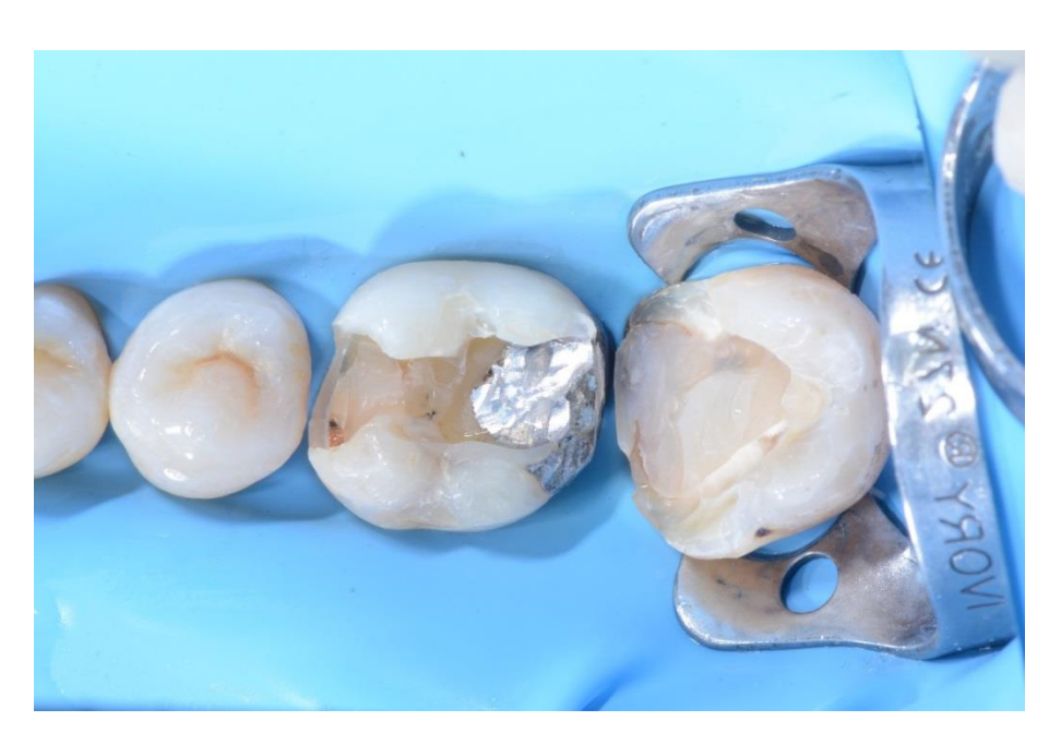
Pre-operative view of 46 and 47 molars showing an old composite restoration over amalgam which should be replaced on #46 and a carious lesion on 47.