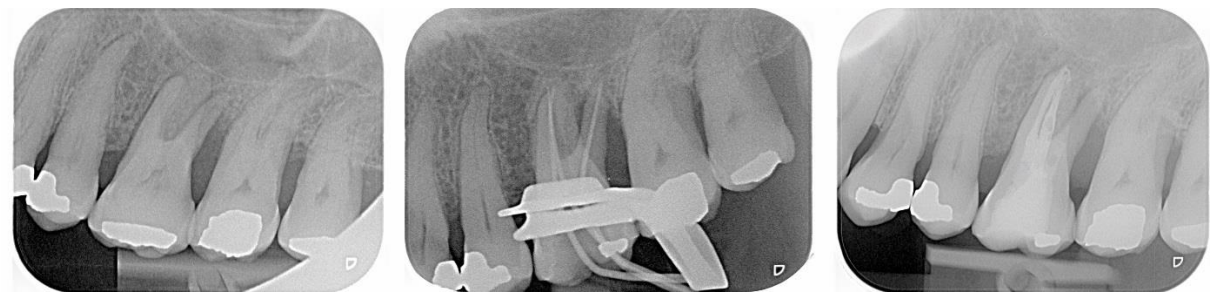
X-Ray images 1-3 (from left to right)

This case study shows the tooth splint procedure with the F-Splint-Aid Slim System, using the direct adhesive technique.