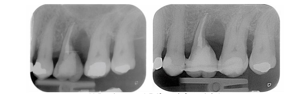
X-Ray images 4-5 (from left to right)