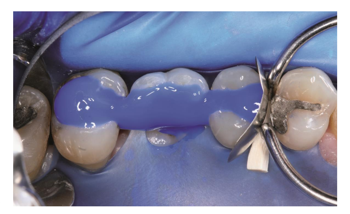
Total etch procedure of the excavated situation with blue etch gel